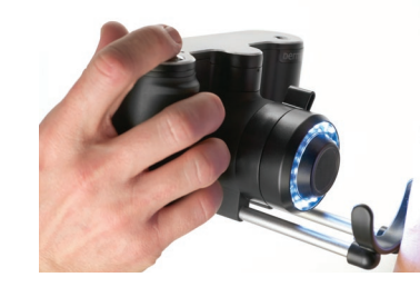
Clinical mode A convenient extension arm provides the ideal